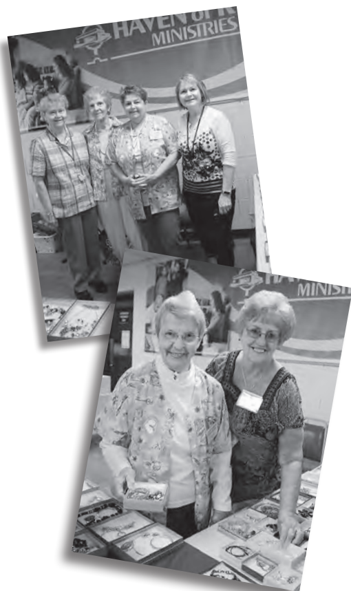
Few of the many Women's Auxiliary volunteers