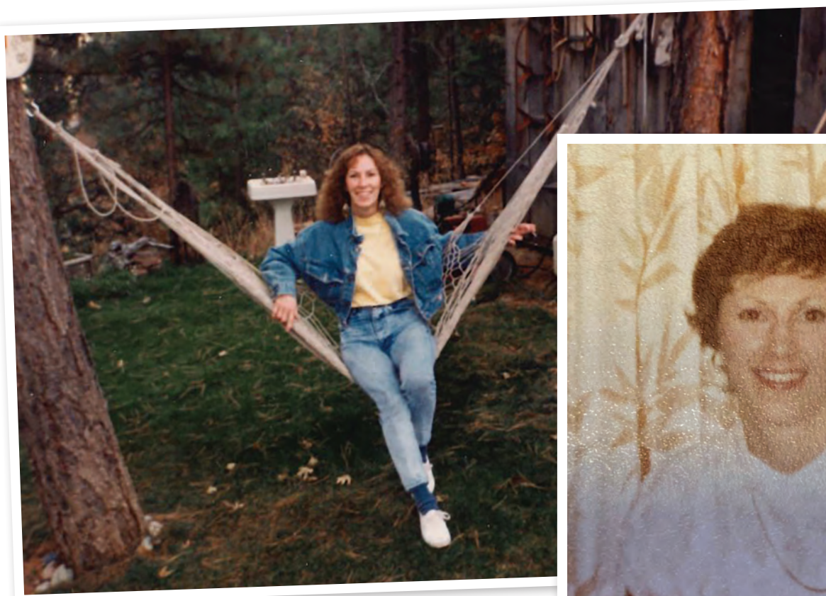
Summer of 1991