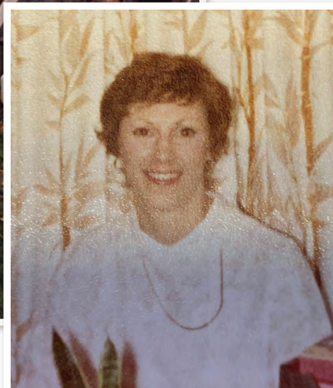
At the Mission's Harvest Home in 1984