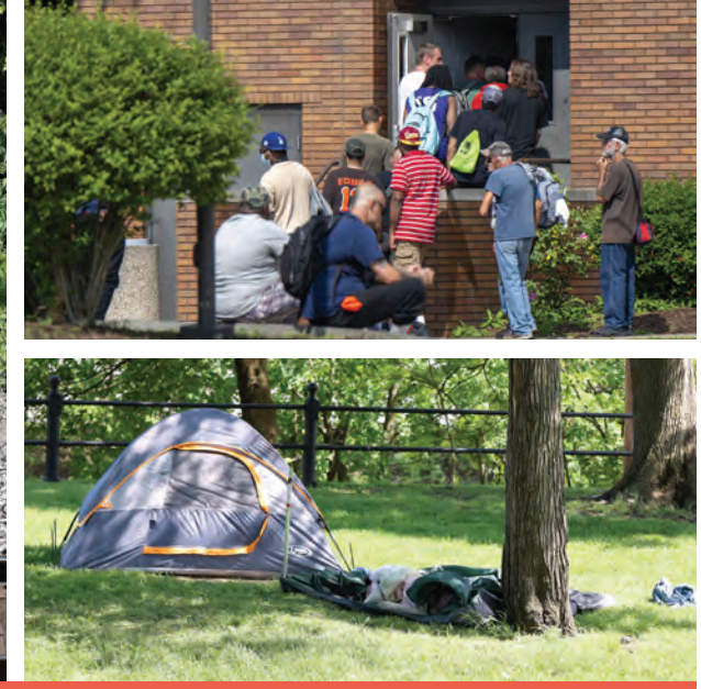
"Your generosity goes straight to work to meet deep needs across our community!"